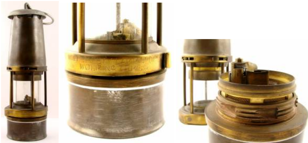
obere und untere Luftregulierung