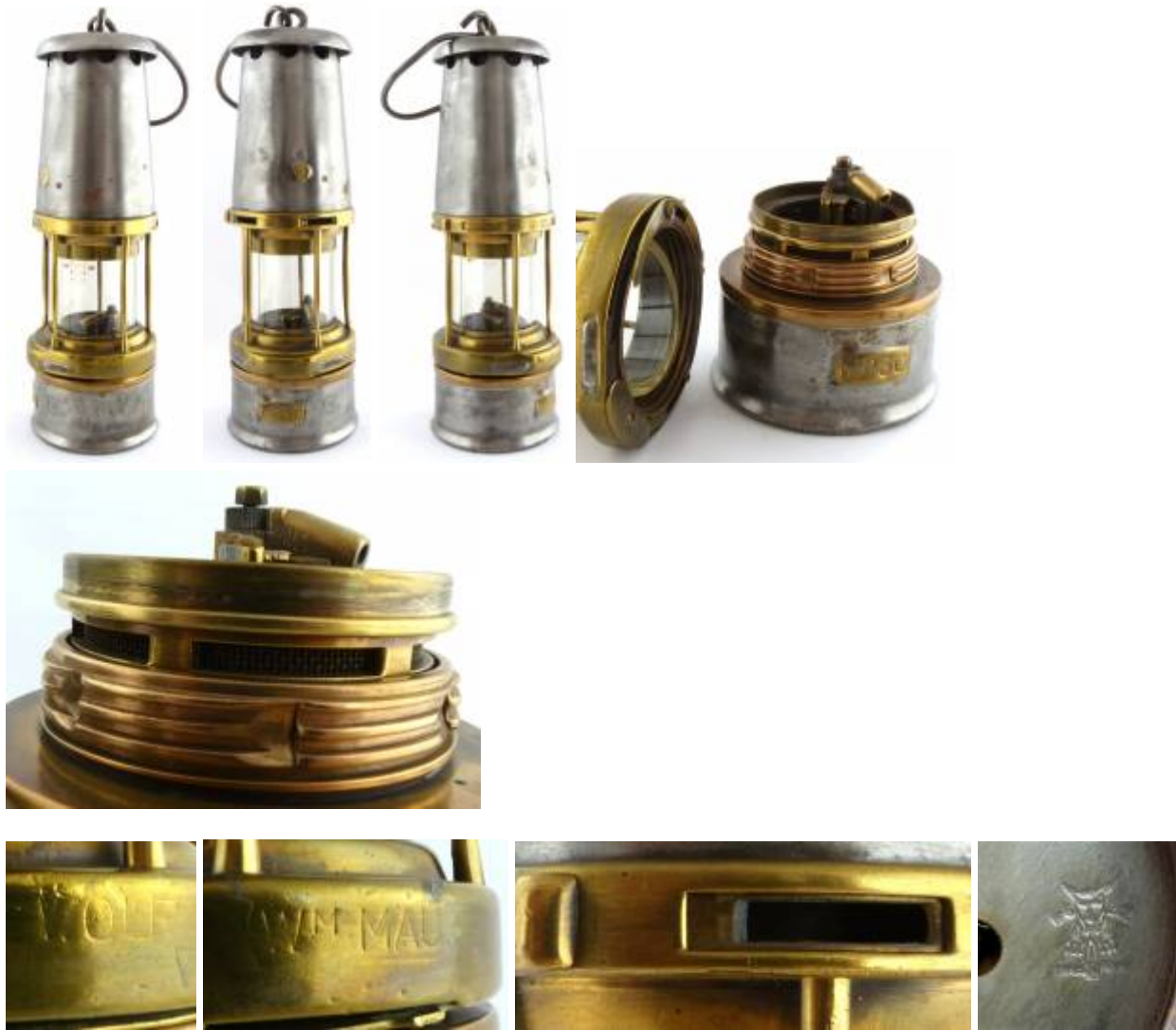
Zünder und regulierbare obere Luftzuführung